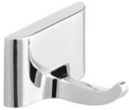
☐ 931 Bradex™ SINGLE ROBE HOOK. 2-1/8"W x 2"D