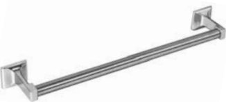
☐ 926 3/4" ROUND TOWEL BAR. PROJECTS 3-1/4" ☐ 18"W ☐ 24"W ☐ 30"W