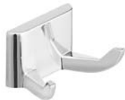
☐ 932 Bradex™ DOUBLE ROBE HOOK. PROJECTS 2-1/8"W x 1-5/8"D