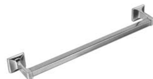
☐ 9301 8-1/2" DEEP TOWEL SHELF WITH TOWEL BAR AND SUPPORT BRACES ☐ 18" W ☐ 24" W