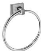
☐ 933 TOWEL RING WITH LUCITE RING