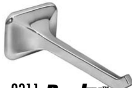
☐ 9311 Bradex™ TOWEL HOOK. PROJECTS 5-1/8"