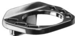
☐ 924 4-1/2"W x 3-1/2"D TUMBLER AND TOOTHBRUSH HOLDER