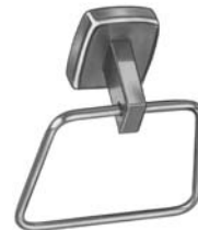
☐ 9335 TOWEL RING. PROJECTS 2-3/8"