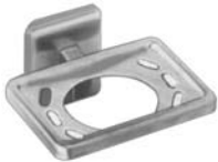
☐ 9045 TUMBLER AND TOOTHBRUSH HOLDER 4-1/4"W x 4"D